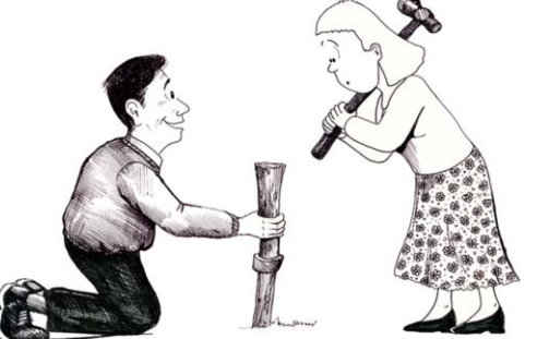
"When I nod my head, I want you to hit it."

Without a clear and structured method of communication, the process leaves room for error, with messages often misinterpreted by one or more of the parties "W involved.